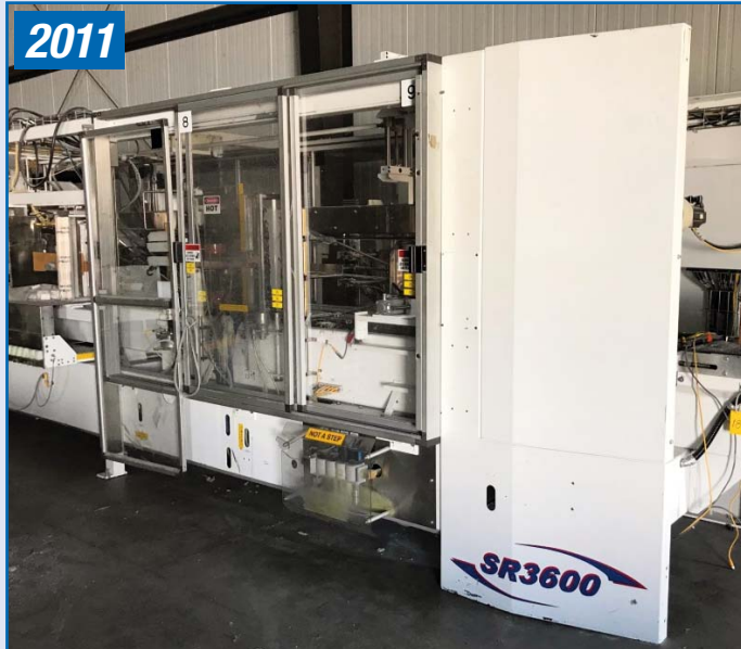
EDSON SR3600 CASE PACKER