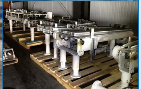
PARTIAL VIEW OF TISSUE CONVERTING & PLANT SUPPORT EQUIPMENT