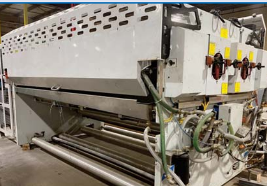
FIBREFLOW FF350 DRUM REPULPING SYSTEM